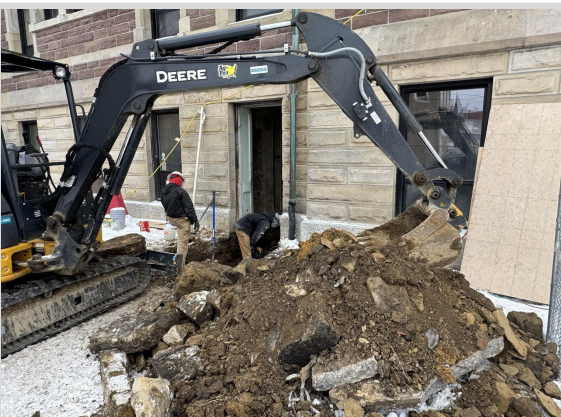
Permanent Power Excavation 1/10/25