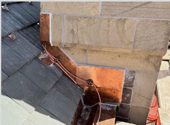
West Elevation Gutter Install 10/25/24