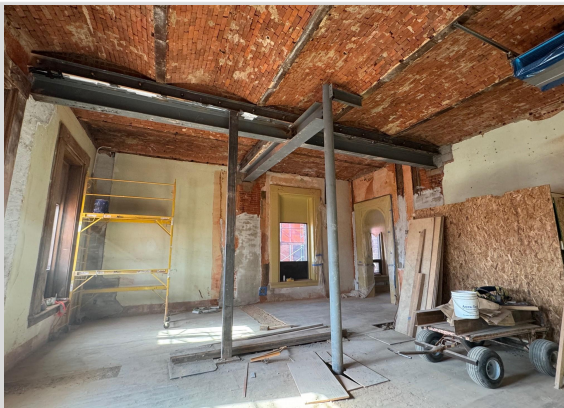
Magistrate Court Steel 10/25/24