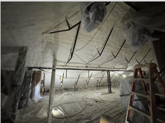
Spray Foam Installation 2/14/25