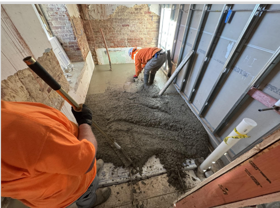
Water Meter Room Concrete Pour 2/14/25