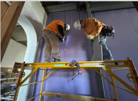
Shaft Wall Install 2/21/25