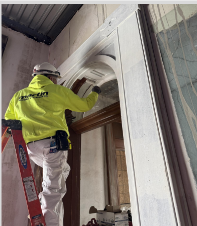
Existing Door Frame Painting 2/21/25