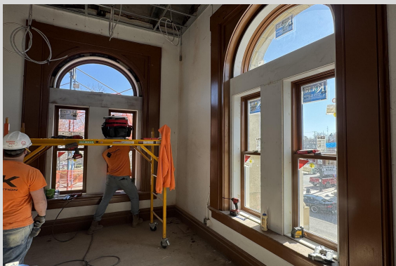
East Elevation Window Trim Install 3/21/25