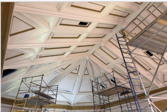
2nd Floor Courtroom Ceiling Painting 3/21/25