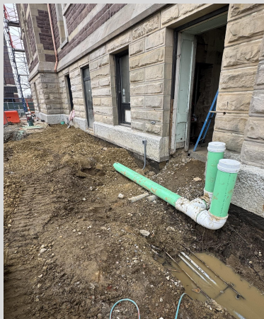
North Elevation Storm Line Install 3/7/25