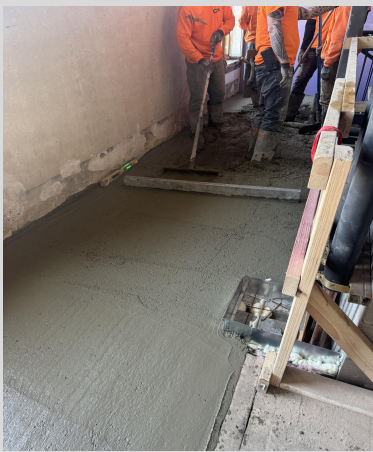
Egress Stair Concrete Pour 3/7/25