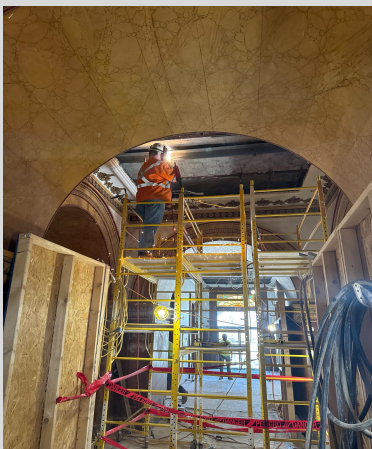
Corridor Stabilization Installation 4/11/25