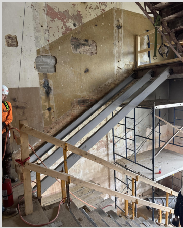
Historic Stair Stringer Install 4/11/25