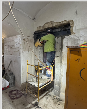
Ground Floor Doorway Lintel 4/4/25