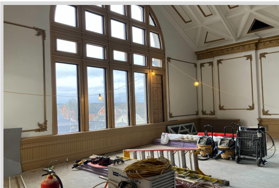
2 nd Floor Courtroom Window Removal 4/4/25