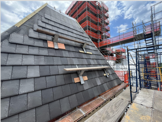
Roofing Tile Installation 6/13/24