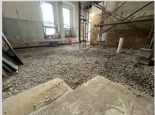
Concrete Slab Preparation 6/14/24