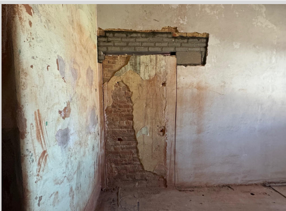
First Floor Door Way Lintel 8/23/24