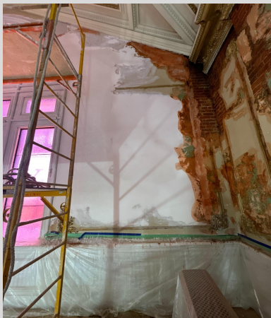
2 nd Floor Courtroom Plaster Restoration 8/23/24