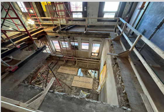
Elevator & Egress Stair Floor Demo 8/30/24