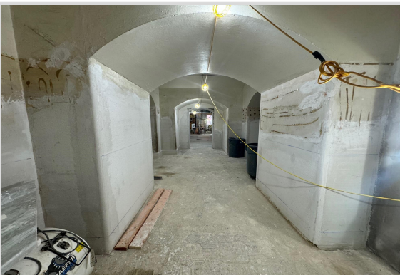
Ground Floor Corridor Plaster Repair 8/30/24