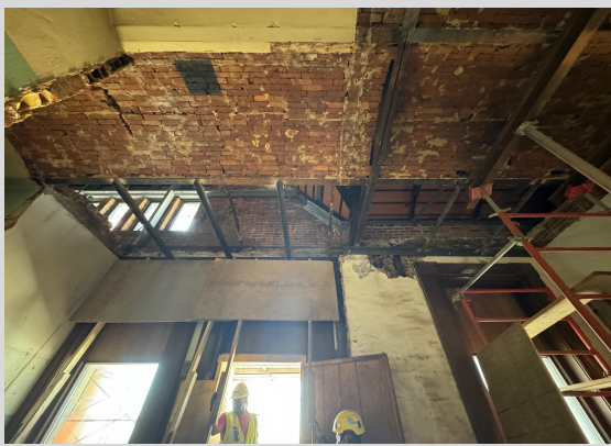
Lateral Beam Bracing Install 9/13/24