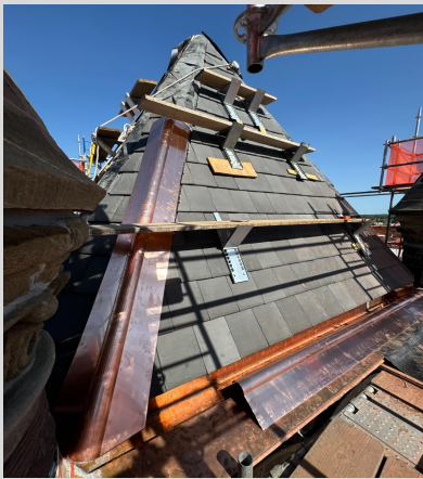
Clock Tower Roof 9/13/24