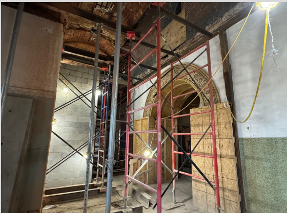
2nd Floor Demo 9/27/24