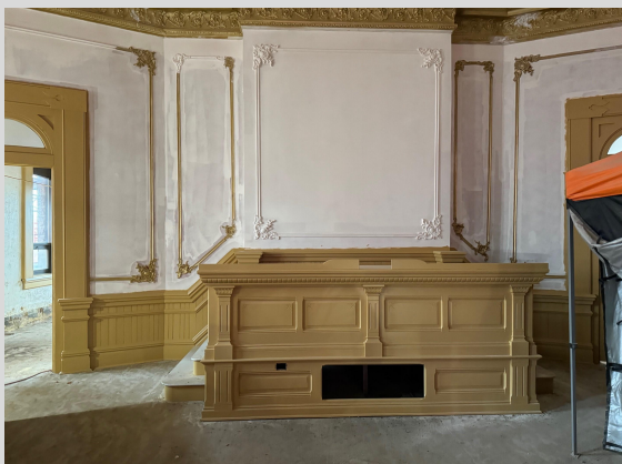
2nd Floor Courtroom Painting 9/27/24