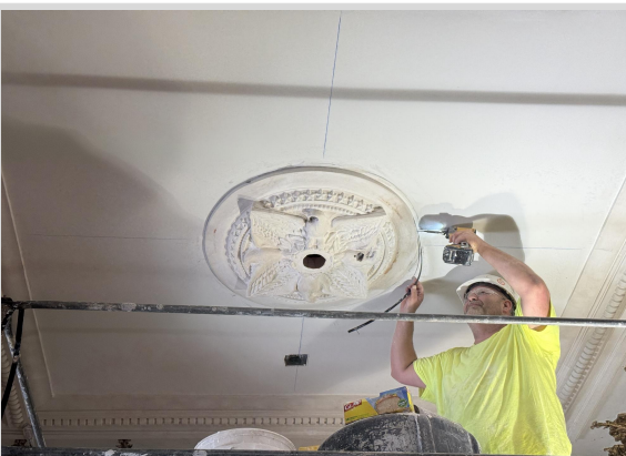
Eagle Medallion Install 6/6/25