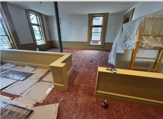
1 st Floor Courtroom Carpet 6/6/25