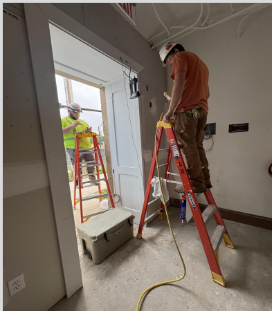
Exterior Door Frame Install 7/18/25