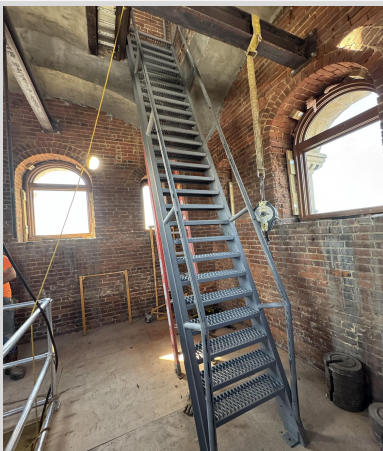
Clock Tower Ladder Install 8/1/25