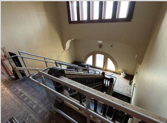
Historic Stair Handrail Install 8/1/25